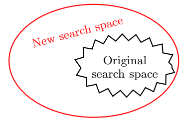
Figure 1: The Basic Approach

Roughly speaking, one way to show how more data can reduce the training runtime is as follows. Consider learning by finding a hypothesis in the hypothesis class that minimizes the training error. In many situations, this search problem is computationally hard. One can circumvent the hardness by replacing the original hypothesis class with a different (larger) hypothesis class,