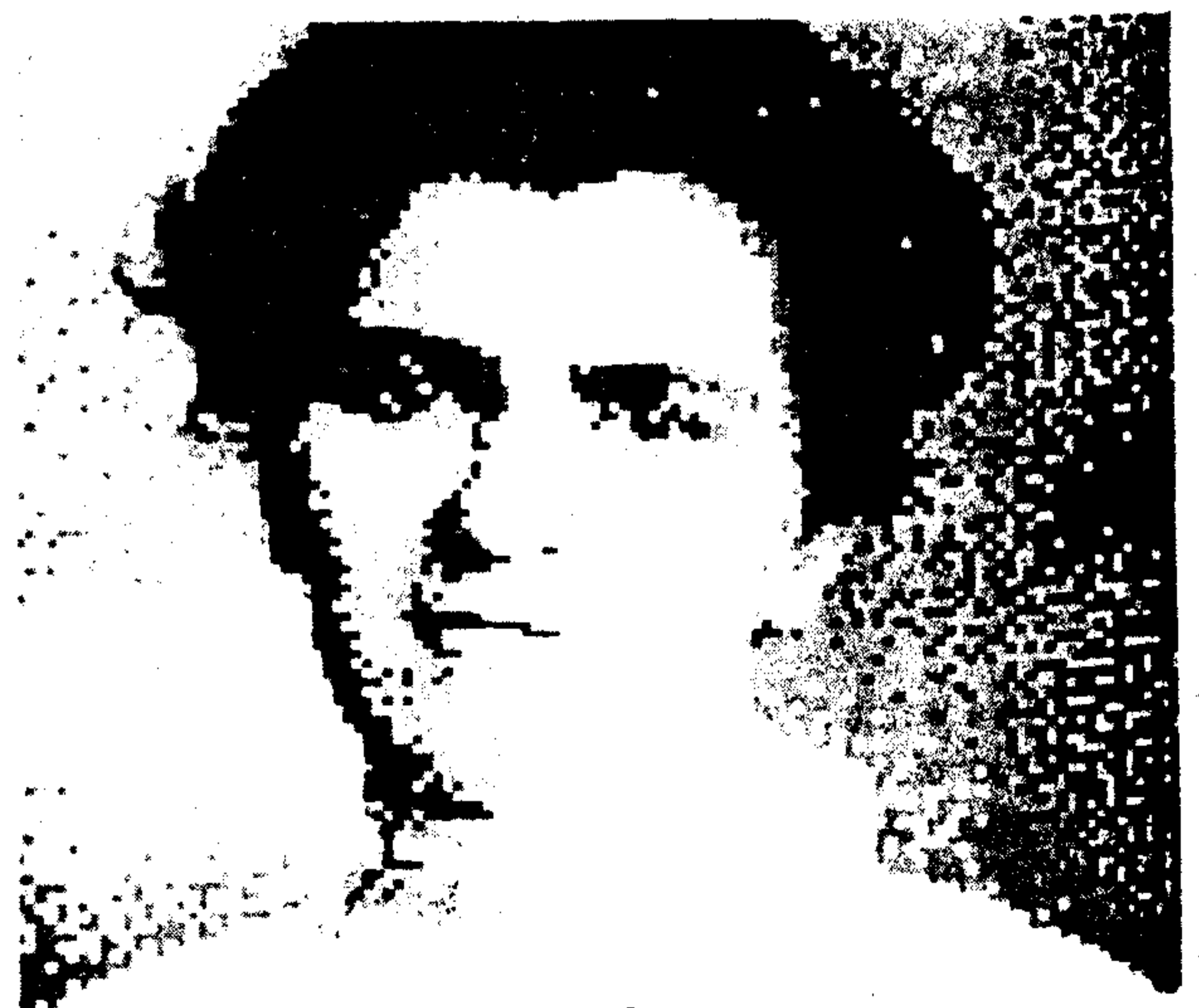
Figure 3: Further enlargement of the picture with five grey levels.