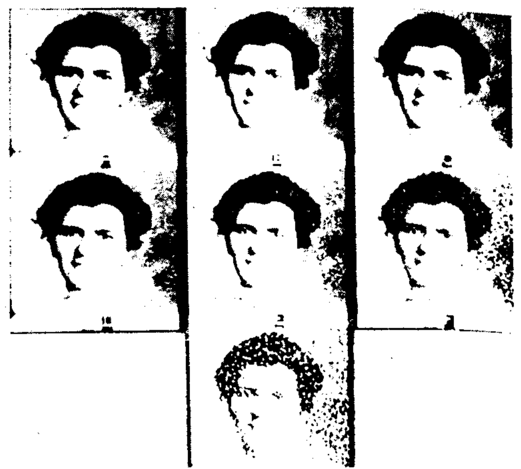
Figure 1: The iterations of the quantization algorithm starting from an original picture with 129 gray levels (A) and ending with a halftone with 2 gray levels (G).