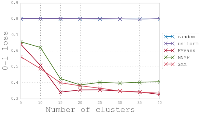
Figure 2. 0-1 loss of hard-assignment to each of the ground-truth classes using each of the methods under consideration. For the soft-assignment partitioning methods, hard-assignment is achieved using argmax. (NNMF: non-negative matrix factorization, GMM: Gaussian mixture model)

proportional to the time spent doing so in the measurement windows. Thus, for a sample with some walking (say, less than 50%) we get a miss in the 0-1 loss metric, but a better score in the log-loss which is more sensitive to assignment of very low probabilities to the correct class.