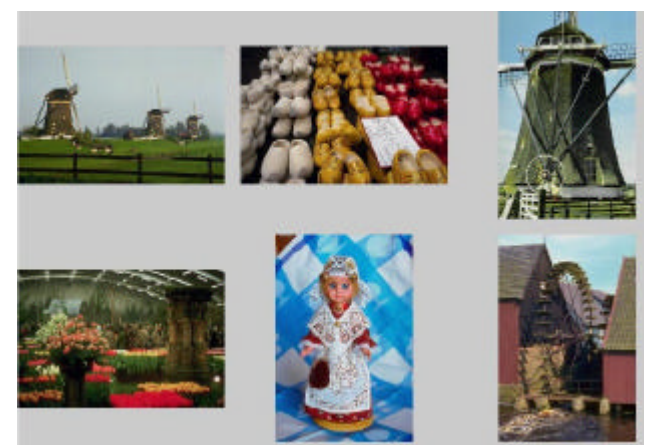
Figure 1. A picture group used in this study. One of these has been previously shown to the subject.

capacity. As we consider our third category, learned behaviors of which the user is unaware[8,9], we find another tradeoff. The subtler effects take longer to learn, and more complex protocols are required to detect their presence. In fact, we concluded that "priming" effects, for example learned skills such as very rapid perception of phrases or graphical icons, exhibit so much individual variation and are so sensitive to user fatigue or mood, that we could not create robust certificates with them at present.