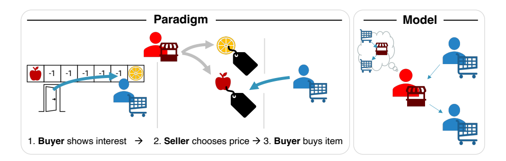
Figure 1: Paradigm and Model